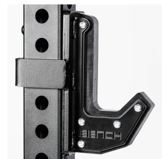
Sandwich J Hooks with high density plastic to protect barbell and rack