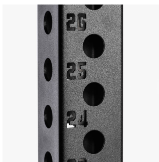
CNC 24 mm laser cut holes (50mm hole spacing)